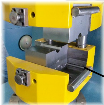
New toolholder system